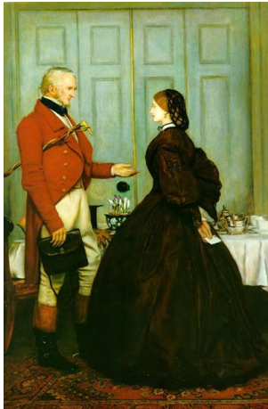
John Everett Millais